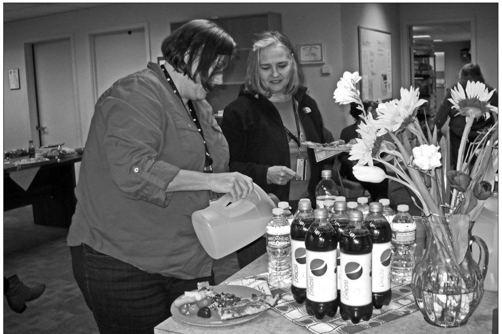
On February 14, the Baby Corner held a lunch to thank service providers and wish them well.

For more information on Maternity Support Services in King County and the budget, please visit http://www.kingcounty.gov/healthservices/health/budget .